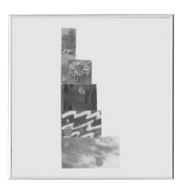
Simón Ramirez, Fuego , 2021 Graphite on paper 14 x 14 inches