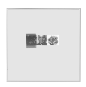
Simón Ramirez, TQM , 2021 Graphite on paper 14 x 14 inches