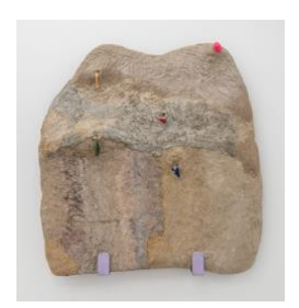
Amra Causevic, Tombstone , 2017–2020 Egg cartons, salt, pigment, music boxes, found objects 40 x 41 inches

Amra Causevic, specimens between 44th street to park place , 2018–2023 Shelf, fluorite, produce bag, googly eyes, false lashes, tile, spray bottle, wood, metal hardware, music box, epoxy, plastic, rusted nail 48 x 4 inches