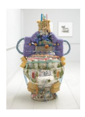
Amra Causevic, Data collector vessels series , 2023 Paper, salt, moss, found objects 24 x 15 inches