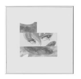
Simón Ramirez, Luna , 2021 Graphite on paper 14 x 14 inches