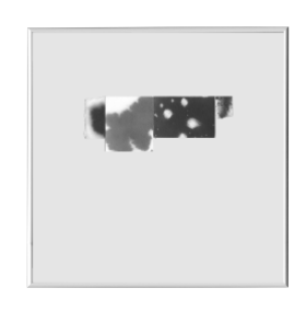
Simón Ramirez, Cultura Magica , 2021 Graphite on paper 14 x 14 inches