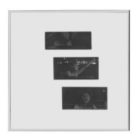
Simón Ramirez, Untitled , 2021 Graphite on paper 14 x 14 inches